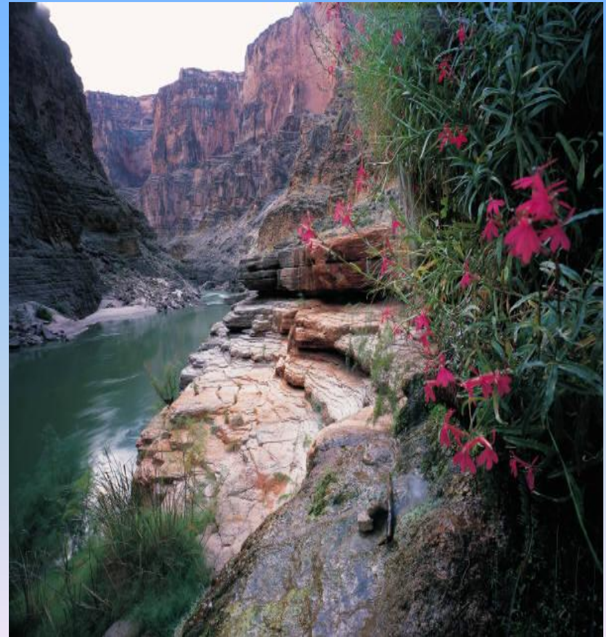
looking at the Grand Canyon