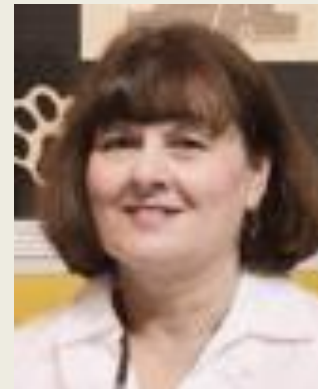
Gail Daniels Marshall Elementary

Employees will be recognized at the May 20, 2015 Board Meeting