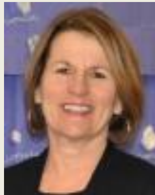
Linda Kleeb Hosack Elementary