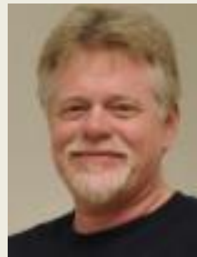
Art Wessel Peebles Elementary