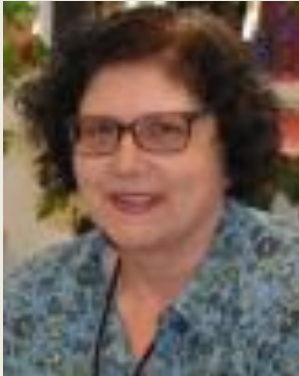
Deborah Devine McKnight Elementary