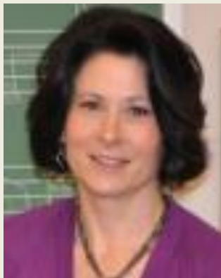
Amy Kegel Hosack Elementary