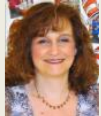
Sherri Hinkson McKnight Elementary