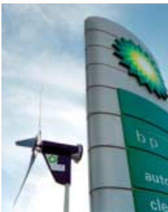
BP sought to align itself with sustainable energy resources, rather than the old-line commodity energy business.

Competitive edge: Finally, globalization has made market competition even tougher. Who hasn't outsourced noncritical business functions, focused on their core competency and shed underperforming assets? Building lasting competitive advantage in the market has become harder, and leading companies