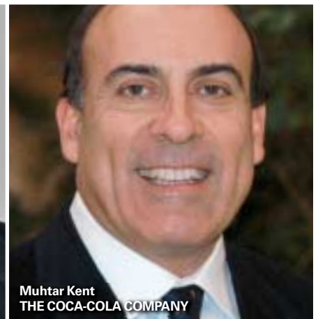
Muhtar Kent THE COCA-COLA COMPANY