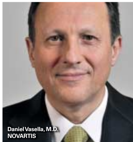
Daniel Vasella, M.D. NOVARTIS