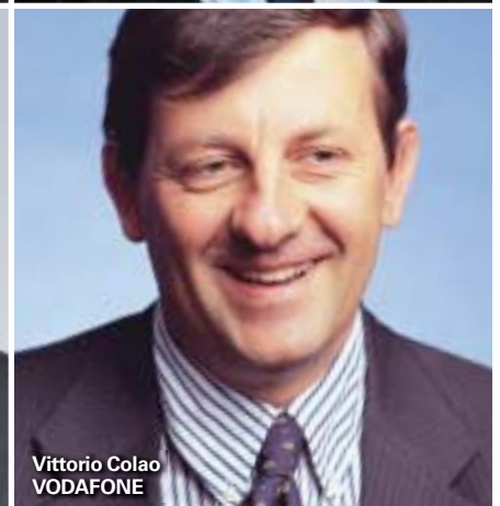
Vittorio Colao VODAFONE