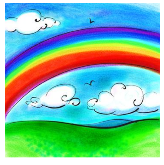
Free template from www.brainybetty.com

If something fills you with awe, you are amazed by it.